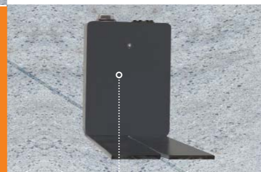
Laser unit Automatic direction control of the measurement device

Operation of the measuring system is easy and convenient. The measuring device can be rolled to the next joint by lowering the retractable transportation wheels. A hinged push handle allows the device to be folded to a compact size for transport.