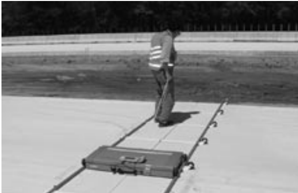
Figure 1. Dowel bar alignment testing using MIT Scan-2.

determining the dowel placement tolerance needed to ensure good pavement performance. This technical brief provides a summary of the current best practices on dowel placement tolerance, including the following key recent developments: