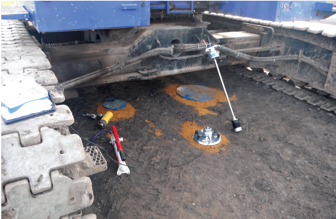
Figure 1: Attempts were made to find and map reinstated trial pits located within a piling rig plant yard

At the first site four trial excavations, which were hidden »